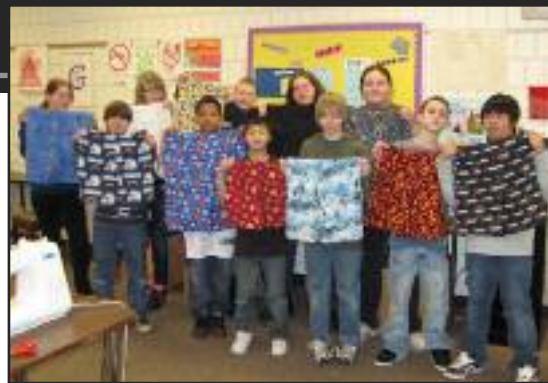
7th graders are proud of the shorts they sew in FACS.