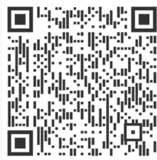
Scan the QR code to access feedback form.

The district is committed to continuous improvement with the goal of improving outcomes for students. This program review is considered part of the district's normal curriculum review process, which could lead to budget efficiencies to maintain quality while effectively delivering education for students.